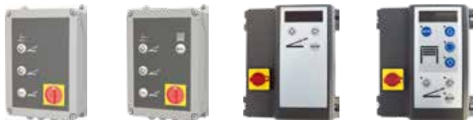
SuperVision 5 (standard)

The dock leveller is operated via the control system supplied along with it, viz. SuperVision 5. The components of the control system are RoHS-compliant (lead-free). The i-Vision control system is available as an option.