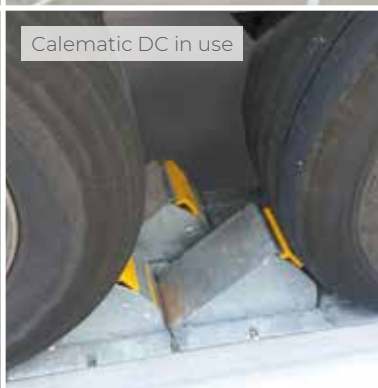
Calematic DC in use