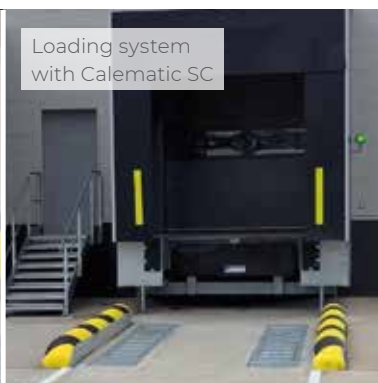
Loading system with Calematic SC